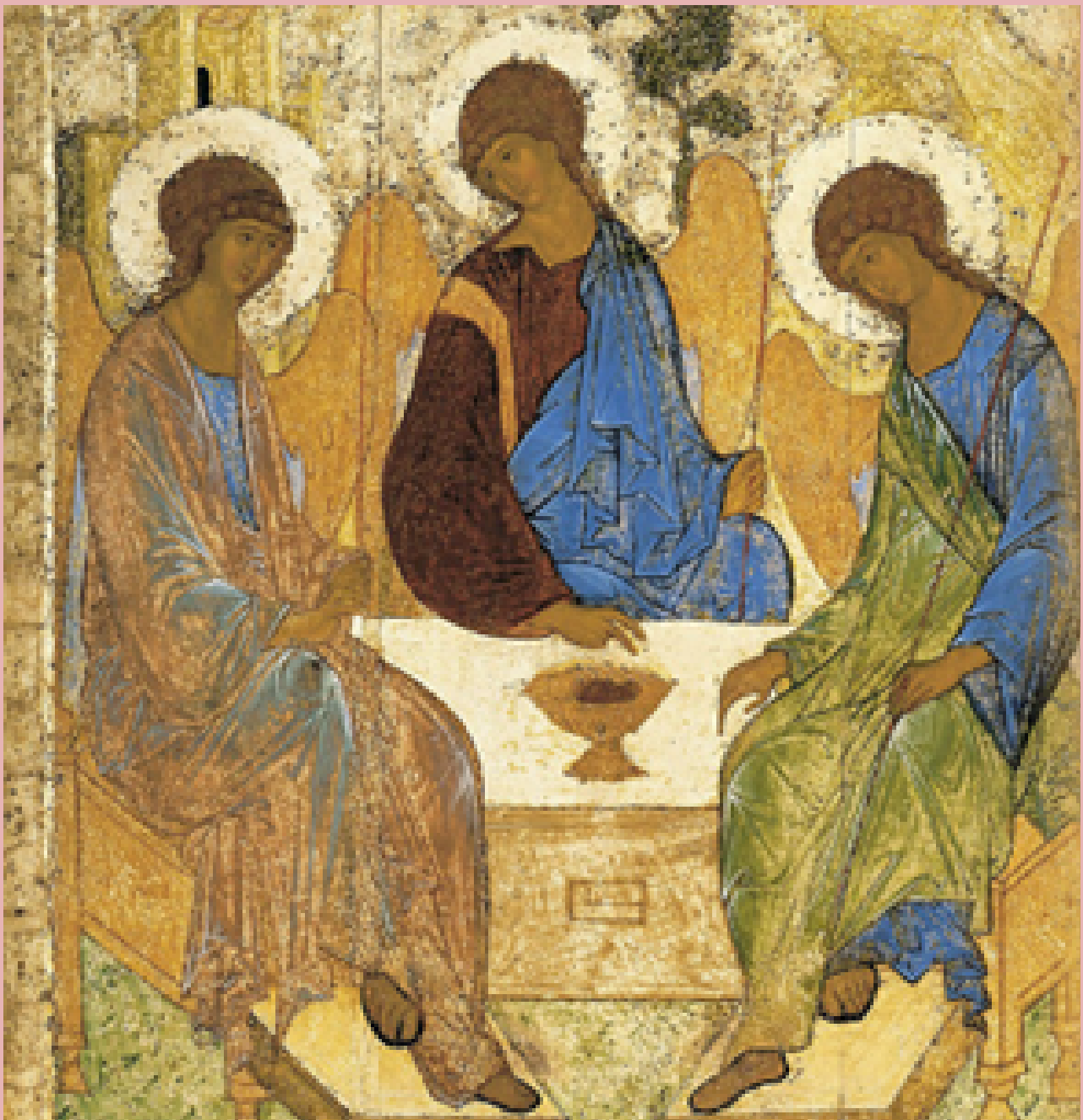
Rublev's Icon of the Trinity